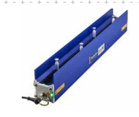
_{f +} ThunderION 2.0 UL withouth support -and end brackets for easy cleaning _{f +}