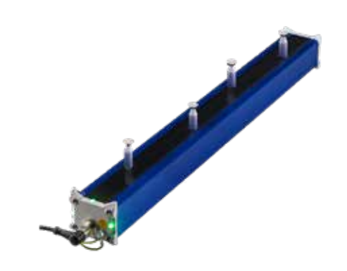
ThunderION 2.0 UL without support brackets, end brackets and sideplates for easy cleaning